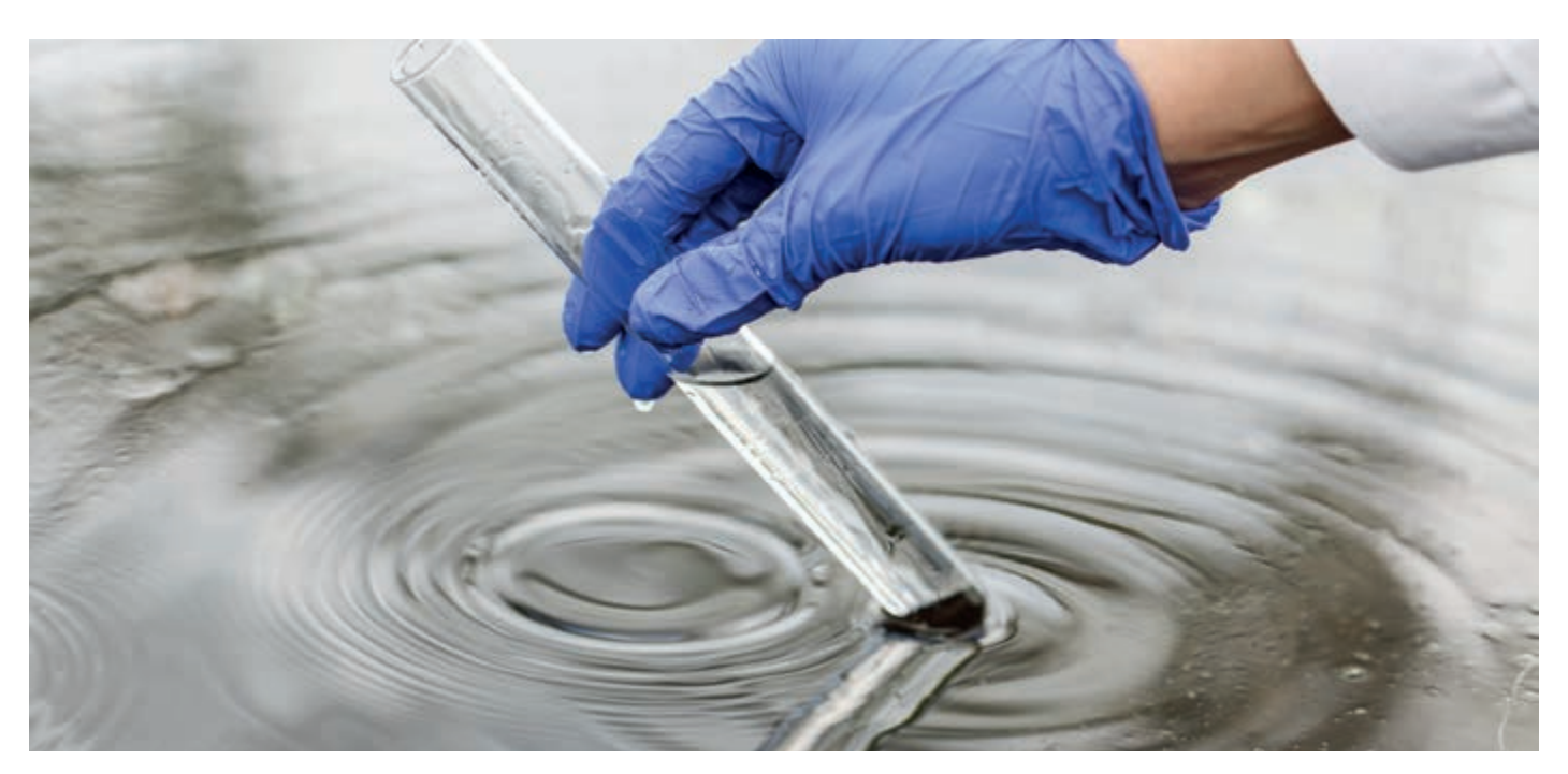
Graph 2. Summary of energy and water consumption

Since 2012, USFQ has been working on initiatives and pilot projects to achieve energy efficiency. For example, after studying energy consumption in various buildings, we took action to lower the high consumption of energy in the library and kitchen areas. The initiative included changing the incandescent light bulbs to LEDs in the library, studying the correct settings for air-conditioning temperatures in the library, and installing automatic locks in the cold room of the kitchen.