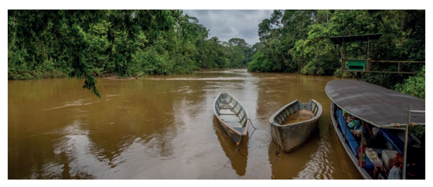
Graph 4. Tiputini Biodiversity Station (TBS)