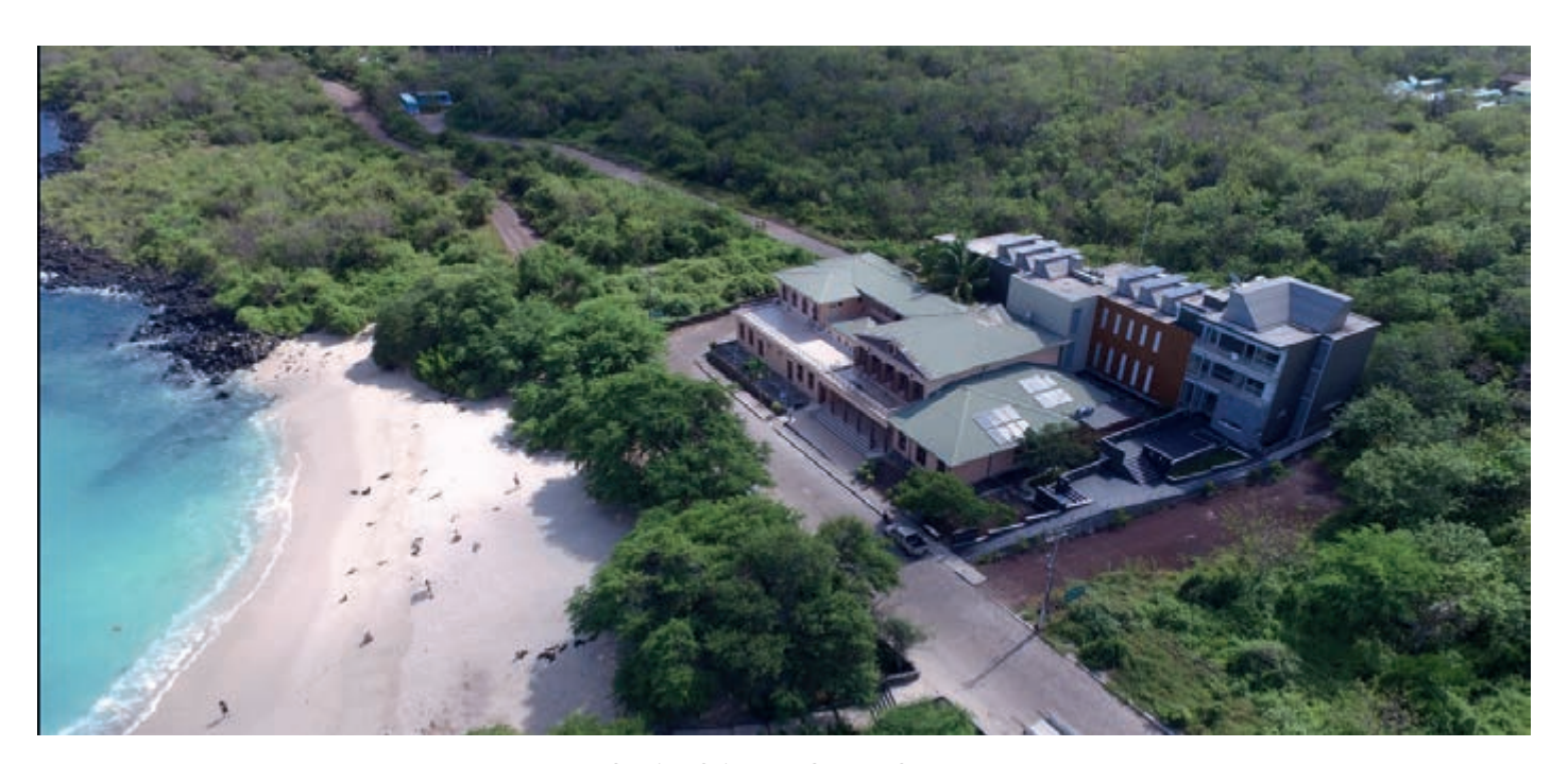
Graph 3. Galapagos Science Center

Link: https://galapagosscience.org/es/galapagos-science-center-2/